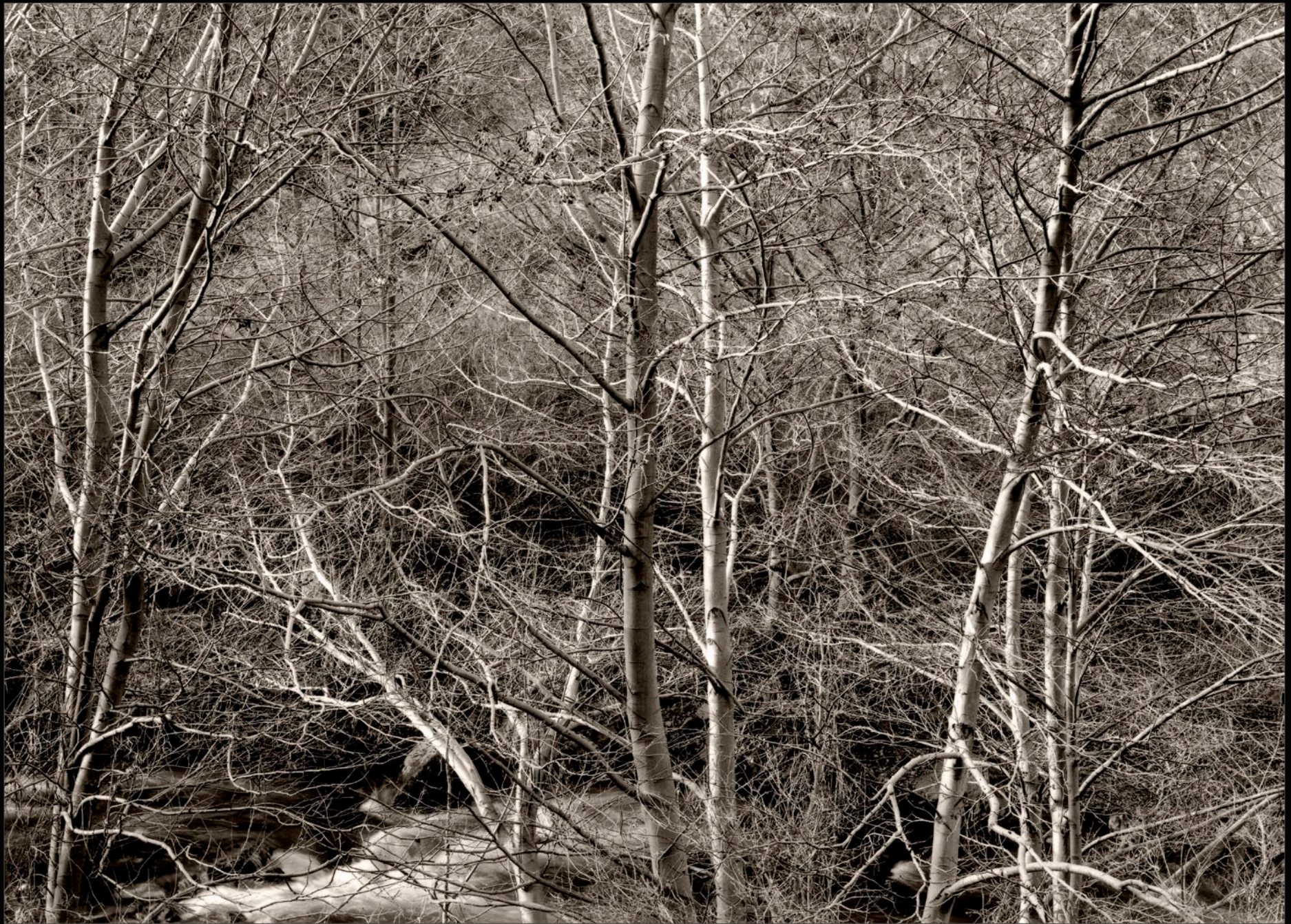
Winter Trees, John Day River, Oregon, 1989