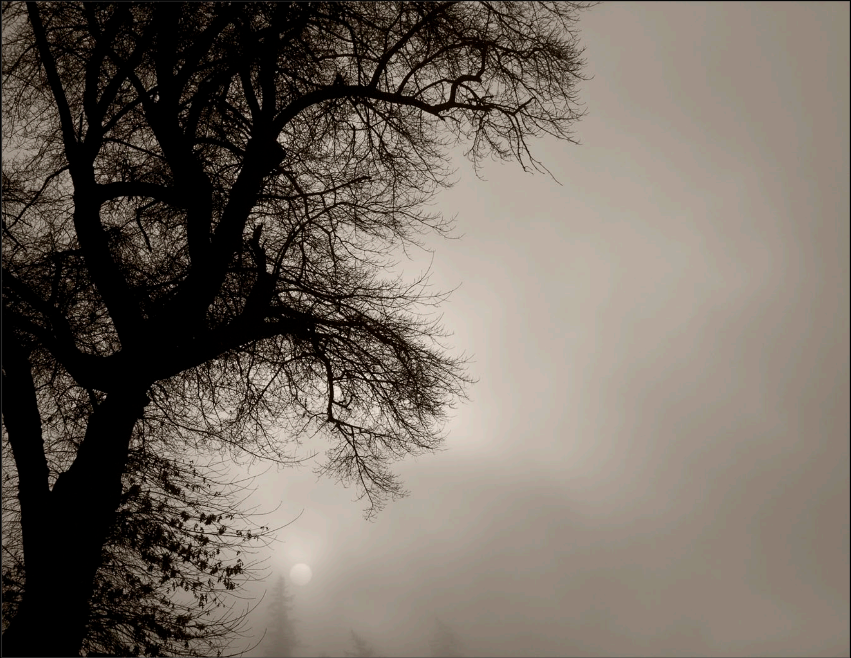
Winter Tree, Fog, and Sun, Mt. Vernon, Washington, 2004