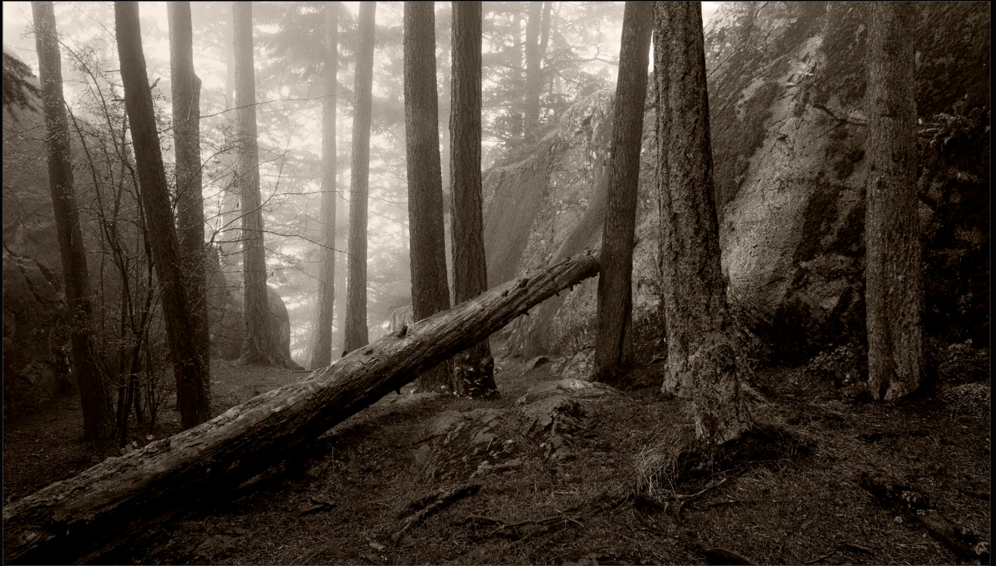
Fallen Log, Rain, Mt. Erie, Fidalgo Island, 2006