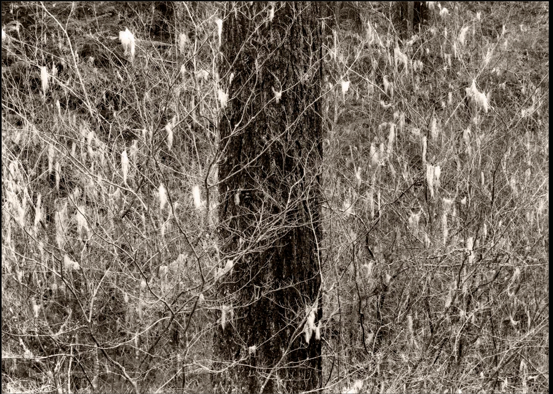
Winter Trees and Moss, Clackamas River, Oregon, 1990