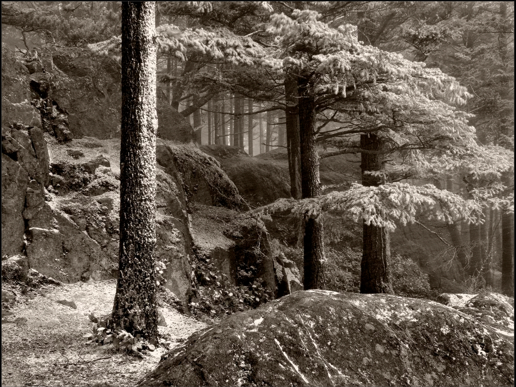
Winter Trees, Mt Erie, Fidalgo Island, Washington, 2003